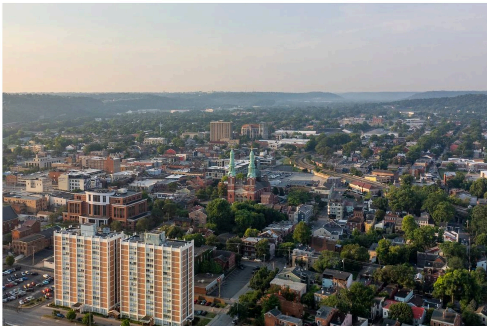
Downtown Covington, Ky., is photographed Sunday, July 14, 2024.

It also would rob Campbell County of two of its crown jewels: The Salmon P. Chase College of Law and the Northern Kentucky campus of the University of Kentucky College of Medicine would relocate six miles from Highland