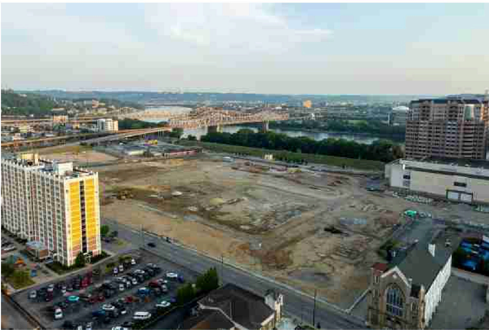
Excavation work was underway this summer at the Covington Central Riverfront site in downtown Covington, Ky.

There were no hearings. No public pronouncements. No discussions with those who might push back.