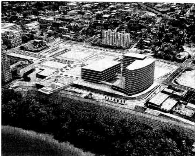
A rendering shared via email of the potential new campuses for Northern Kentucky University's Chase College of Law and University of Kentucky College of Medicine-Northern Kentucky Campus on the Central Covington Riverfront site.